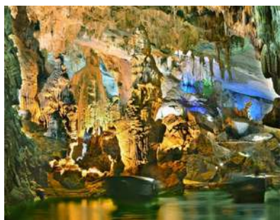
Phong Nha Cave

Lunch and dinner at Vietnamese restaurants