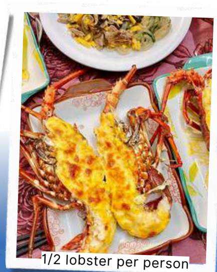
1/2 lobster per person