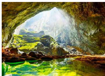
Phong Nha Cave